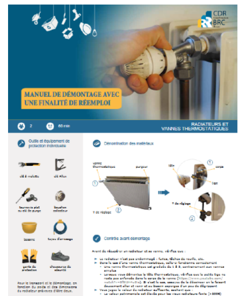
Illustrated manual for dismantling a radiator (in French): https://reuse.brussels/nl/radiateurs-et-vannes-thermostatiques/

Most of the reclaimed building materials are sold as is. The conditions of sale may however contain special guarantees specific to the material. Some suppliers are able to indicate the origin of the material and/or provide documentation on the product purchased (for more information, see the introductory sheet).