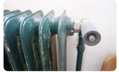
Certain sheet steel radiator models can be confused with cast iron radiators.

It is advisable to involve specialised professionals to ensure the smooth running of these operations.